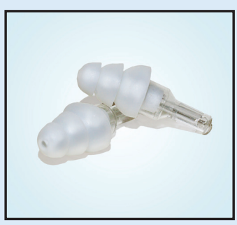
Pre-molded, high-fidelity earplugs