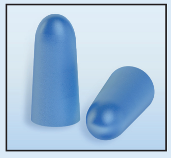
Formable foam earplugs

Wearing earmuffs and earplugs together can further reduce sound, which is great for very noisy environments like woodshops and shooting sports events.