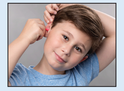
Pull back and insert