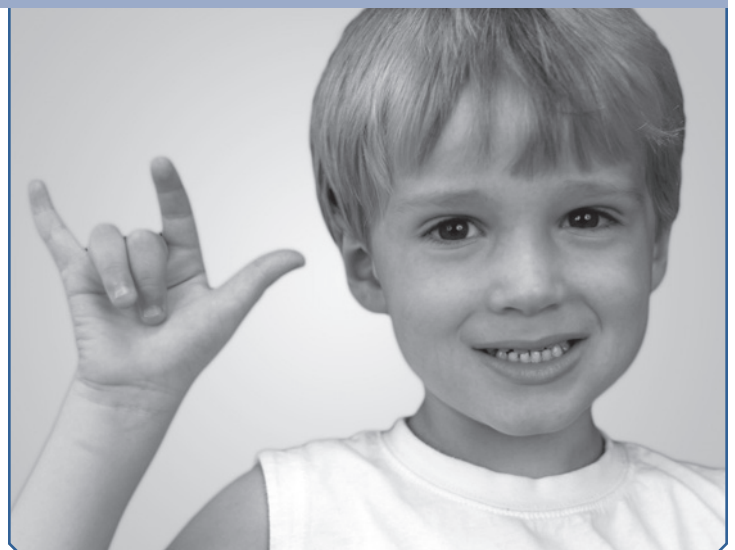
A young boy signs "I love you."

No person or committee invented ASL. The exact beginnings of ASL are not clear, but some suggest that it arose more than 200 years ago from the intermixing of local sign languages and French Sign Language (LSF, or Langue des Signes Française). Today's ASL includes some elements of LSF plus the original local sign languages; over time, these have melded and changed into a rich, complex, and mature language. Modern ASL and modern