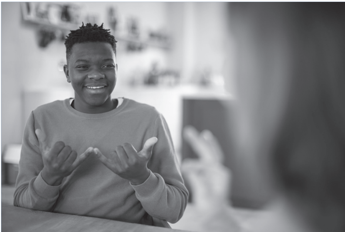
Teenage boy having a conversation using sign language.

The NIDCD is also funding research on sign languages created among small communities of people with little to no outside influence. Emerging sign languages can be used to model the essential elements and organization of natural language and to learn about the complex interplay between natural human language abilities, language environment, and language learning outcomes. Visit the NIH Clinical Research Trials and You website ( https://www.nih.gov/health-information/nih-clinical-research-trials-you ) to read about these and other clinical trials that are recruiting volunteers.